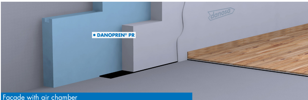
Facade with air chamber